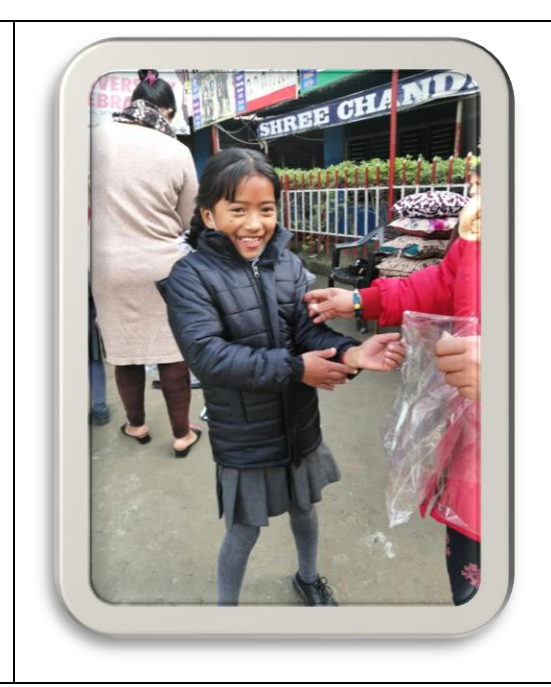
Happy Children after wearing Jacket, Fits well!!