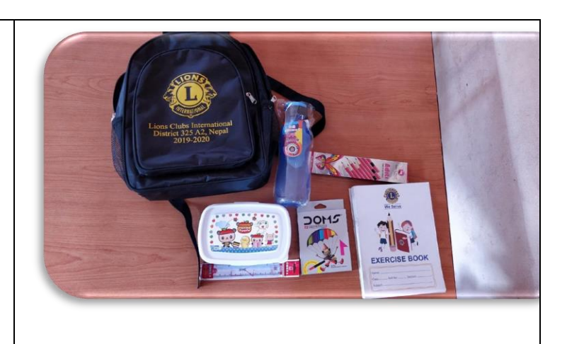
Lots of goodies inside bag